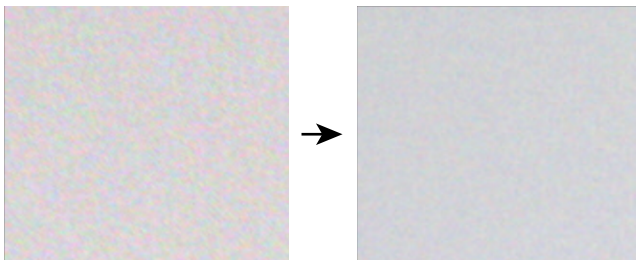
Low Noise Images